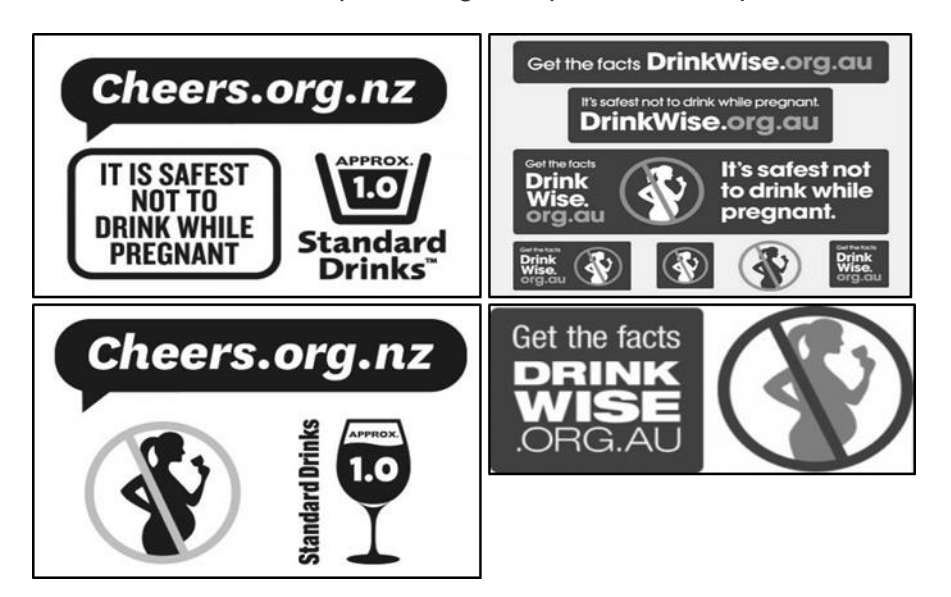
Figure 1: Pregnancy warning labels in New Zealand (left) and Australia (right)

while pregnant' and a pictogram featuring a silhouetted pregnant woman holding a drinking glass enclosed within a circle with a diagonal strikethrough. The organisational website is also included in some options. Figure 1 provides examples of the various voluntary logos.