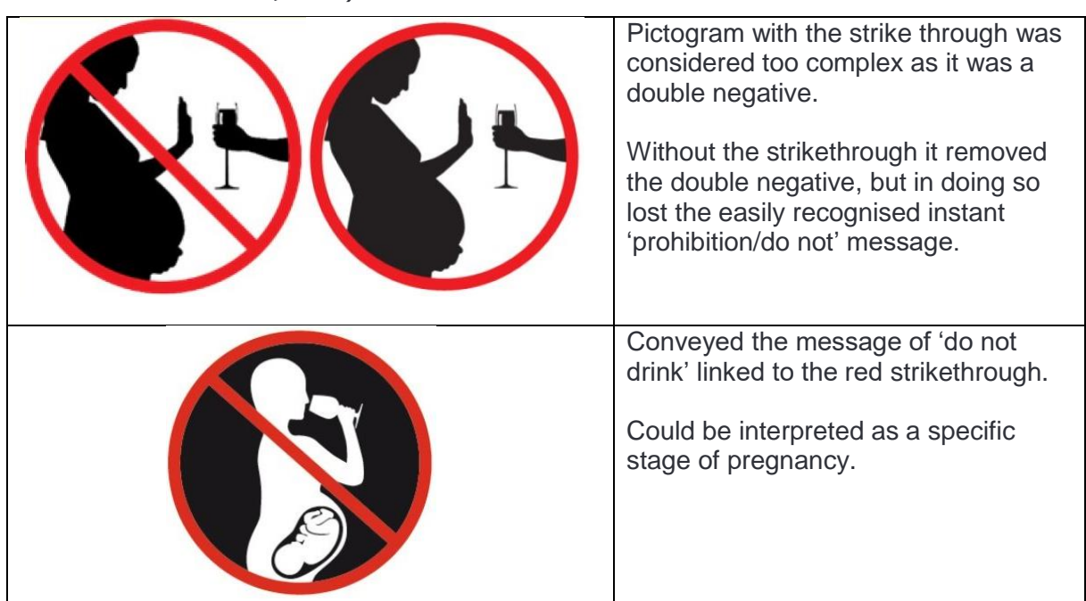
Table 4: Comprehension of alternate pictograms and warning statements

Hall & Partners (2018) also tested a range of alternate pictograms and warning statements.. A brief summary of the comprehension findings from these is at Table 4.